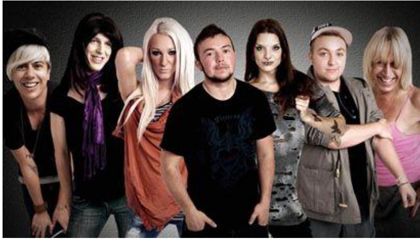
The Cast of Channel 4's 'My Transsexual Summer' Thursday 23 rd February at Gorgeous